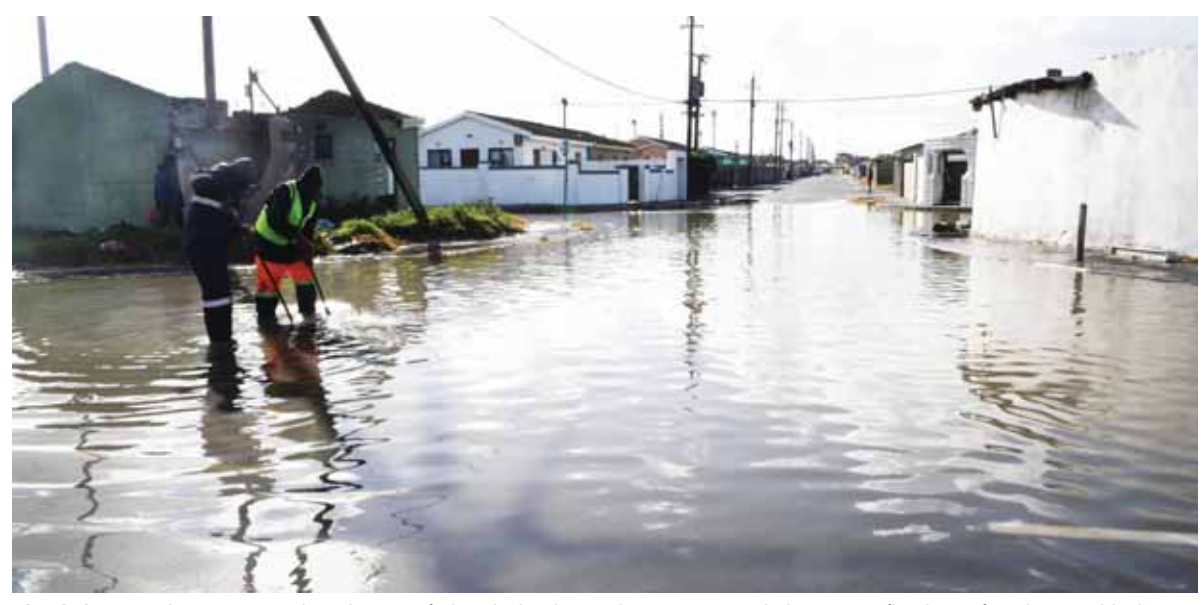
Flood alert: Low-lying areas, such as the part of Khayelitsha shown above, are particularly prone to flooding, often due to rubbish thrown into stormwater drains or on the roads, or other debris not cleared.

The City does all it can to reduce the risk of winter flooding in low-lying areas, but residents also need to play their part.